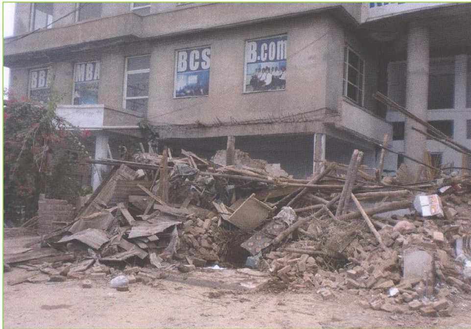
A view after encroachment removed

In compliance with Peshawar High Court Orders regarding removal of encroachments, special campaign has been started wherein all illegal encroachments have been identified and in some cases encroachments removed. Almost in all districts efforts are made to remove such encroachments. As the problem has dimensional factors and in some areas law & order situations created therefore the removal of encroachments by force has been stopped and for time being, instead of force with mutual consent, efforts are underway to negotiate with encroachers who may voluntarily remove the encroachments within stipulated time and in case of non-removal voluntarily, the same would be removed by force.