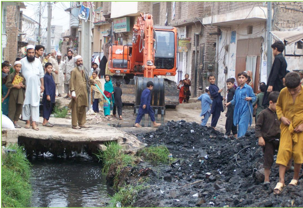
Heavy Machinery for Solid waste removal