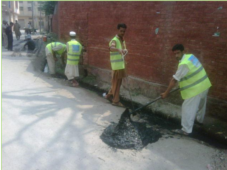
Municipal worker at Cleanliness campaign