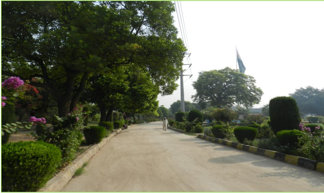
Jinnah Bagh- Firdaus Peshawar