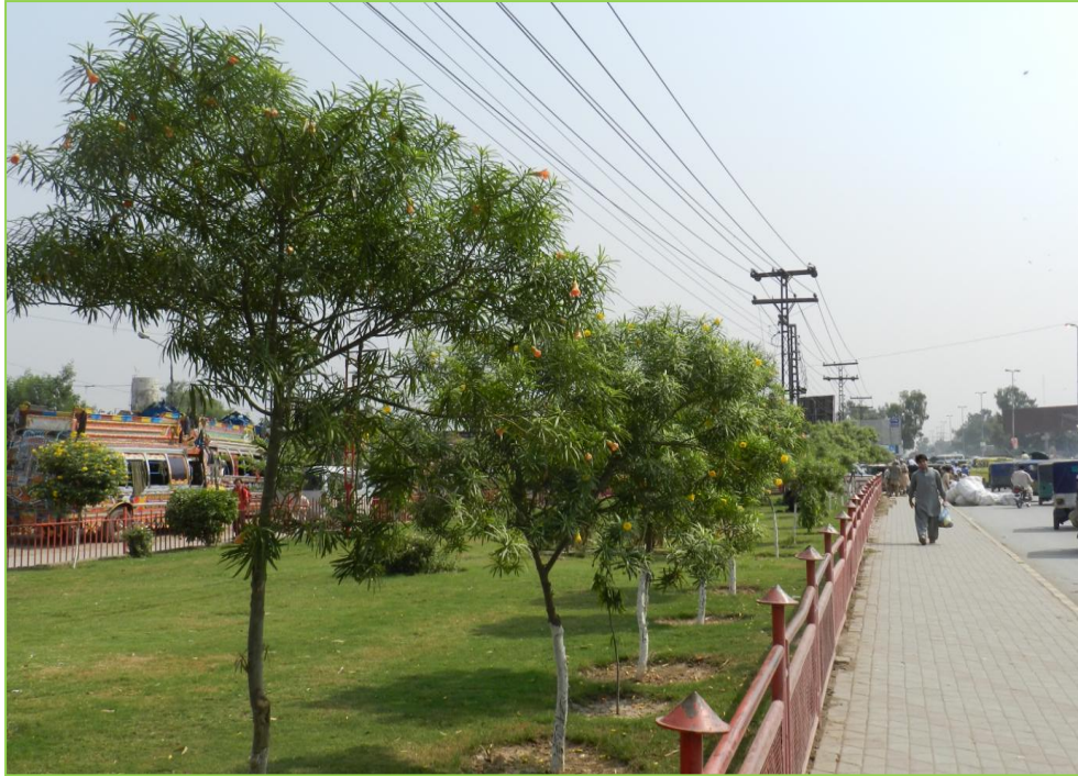
A view of GT Road Peshawar