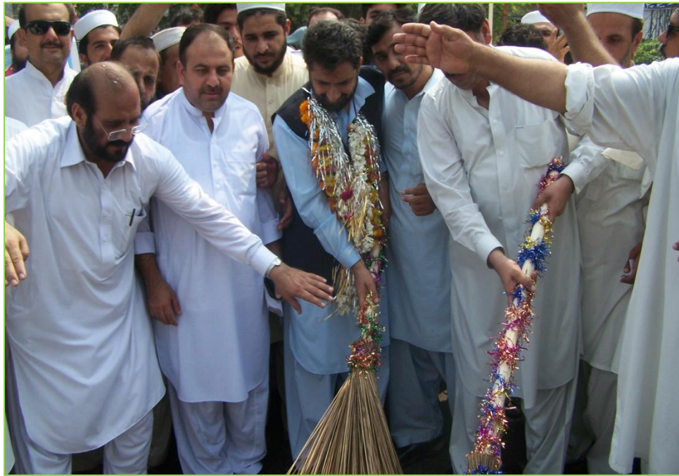
Leading by Example – Launching campaigns