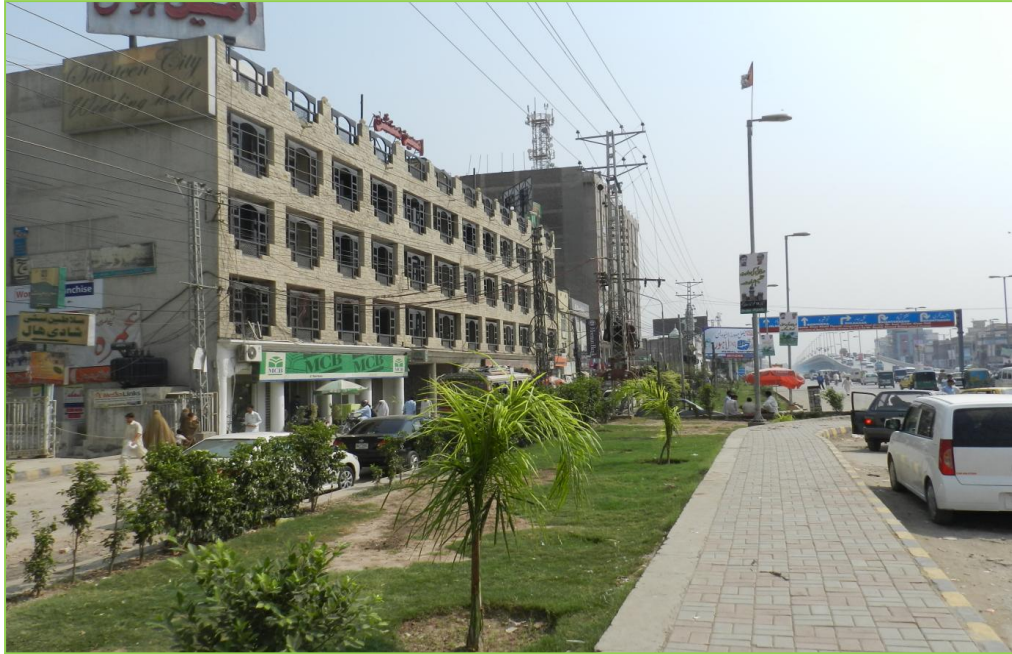
A view of GT Road Peshawar