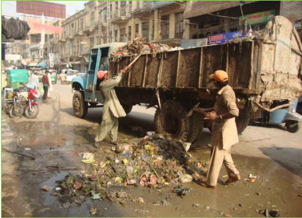
Solid waste Removal