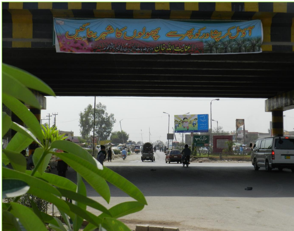
Advertisement for citizens' awareness

As manifesto of the government contains special focus on capital of Khyber Pakhtunkhwa, Peshawar, Local Government, Elections and rural Development Department started a campaign for green and clean Peshawar. Different areas were covered, as mentioned in following photos:-