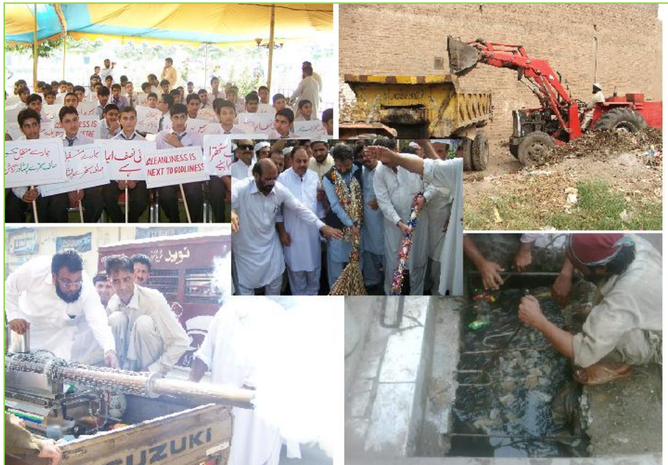
LGE & RDD, a journey of change

Local Government, Elections and Rural Development Department, Khyber Pakhtunkhwa is working for realigning provincial policies and local government systems towards results. Community participation is encouraged for sake of good governance and feel of change at their door steps.