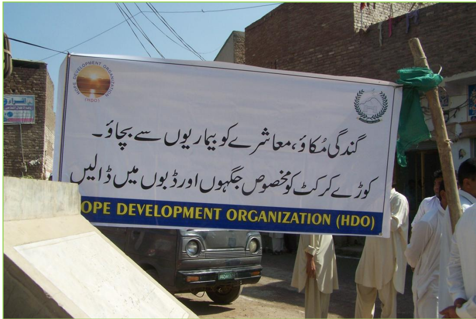
Advertisements for Citizens awareness

A one month special campaign on improvement of sanitation and Municipal Services in urban areas has been launched . it has been started from September 11, 2013 to October 10, 2013 in all districts of the Khyber Pakhtunkhwa. In this regard all Chief Coordination Officers of district councils, Chief Municipal Officers of all Municipal Committees and all Project Directors of Local Areas authorities were directed to attend a meeting on 28-08-2013. The meeting was attended and all concerned officers were directed to improve delivery of sanitation, water supply, street lights, pavement of street and other Municipal Services within the available means so that the general public of the respective areas may feel the change and the solid wastage are to be removed and photographs of the same will be sent to the Provincial Government after doing the needful.