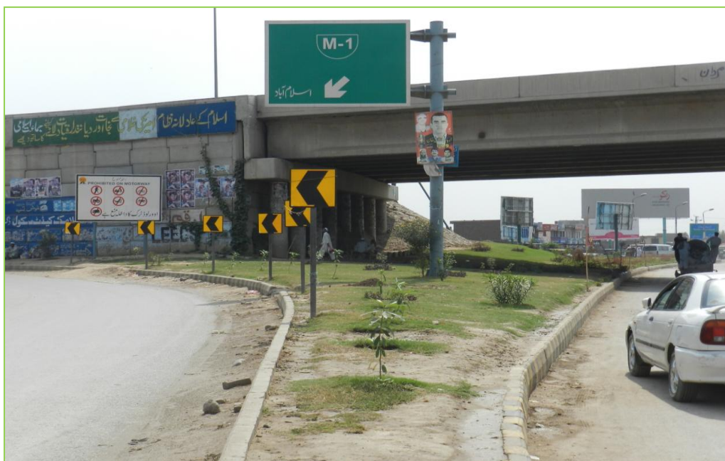
Welcome to Motorways M1