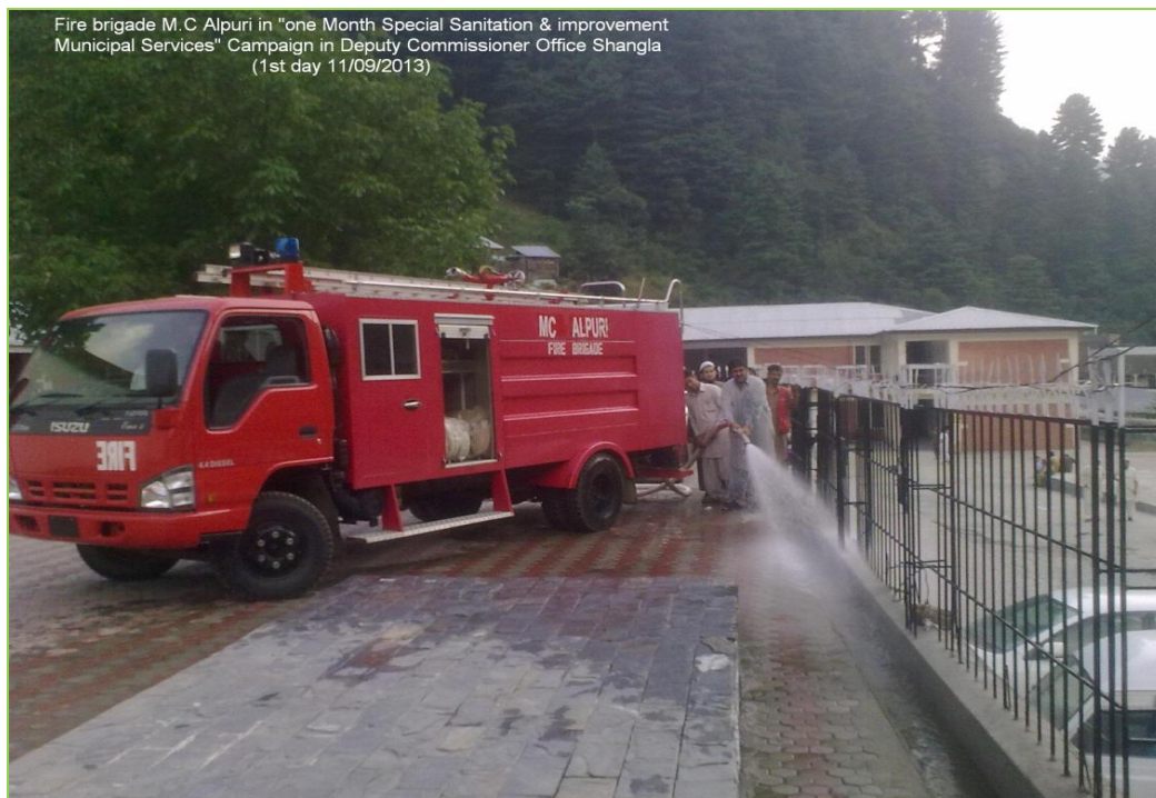
Fire brigade workers at action