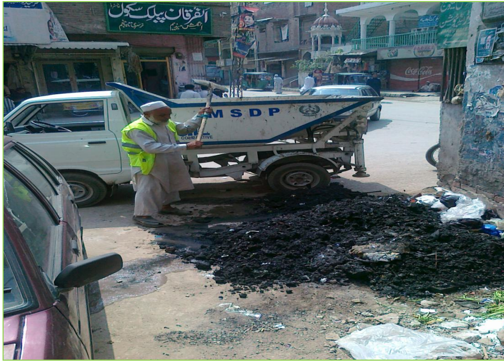
Use of Modern tools for Solid waste removal