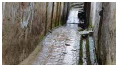
The water supply network in the village will undergo major rehabilitation and expansion

“CDLD funding is enabling us to accomplish a project like never before. We are taking full ownership in the project implementation through our direct participation in all stages. We have also ensured the post-completion operation and maintenance of the water supply project as this is our initiative and its continued success means a lot to us. Through the project management and procurement committee, we are also making sure that the quality and quantity of material are not compromised. The community’s share of 10% is also coming in the shape of human resource”. As Tariq and the CBO members prepare to work with the government assigned engineers, the people of Matkani with their innovative approach of community participation are opening a new gateway of development in Khyber Pakhtunkhwa.