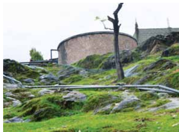
Successful completion of the project will benefit 85% of the village households

The Government of Khyber Pakhtunkhwa launched the CDLD Policy to improve the quality and delivery of basic services by involving ordinary citizens in prioritising and implementing their development needs. The CDLD Policy is being piloted for implementation in the six districts of Malakand Division, including Malakand District. Offices of the Deputy Commissioners are overseeing and coordinating the implementation of community level infrastructure projects (ranging from Rs. 0.5 million and Rs. 2.5 million, over a maximum period of 18 months) in partnership with the CBOs which are formed, supervised and managed by the community members themselves.